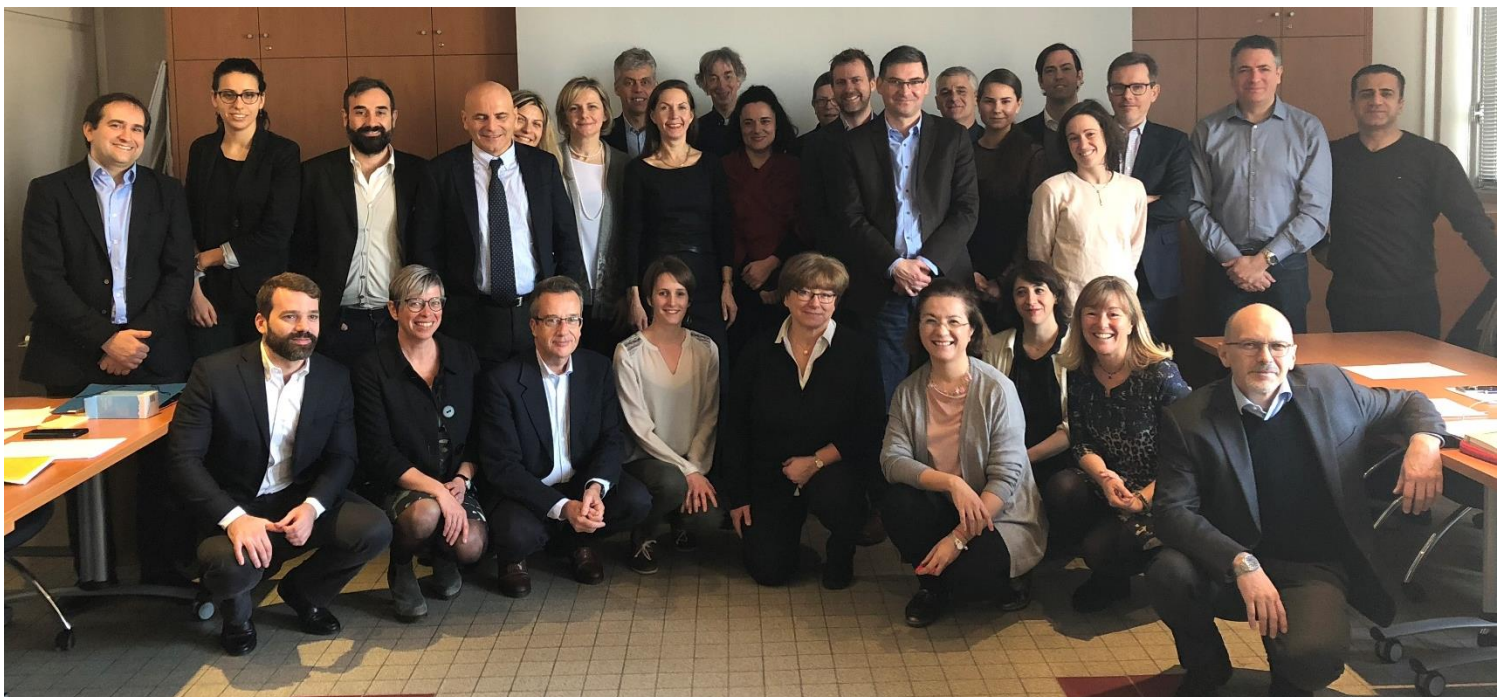
Representative members of the ERN GUARD-Heart at the 5 th Board Meeting in Paris (France) on 13 February 2019.

groups (ePAGs) currently active in the ERN, the ERN continuous monitoring system and the 18 common ERN indicators the monitoring system is based on, update on the CPMS activities of each ERN member, update on ERN registries, evaluation of benchmark studies and plans for new studies, and the general plans for the third ERN year (from 1 March 2019 till 29 February 2020). Notes of the meetings have been produced by the project management office and disseminated among the representative members of the 24 member centres. ♥