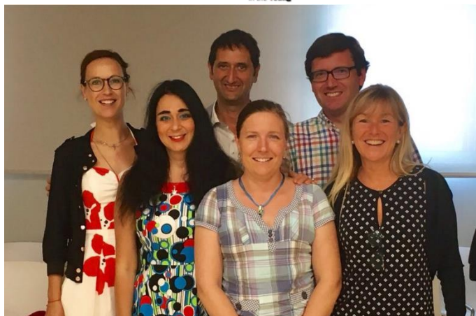
Representatives of the European patients advocacy groups (ePAGs) AMRYC, H4O and SAMS after establishing the Patient Advocacy Board of ERN GUARD-Heart at the Network Board meeting in Barcelona, Spain.