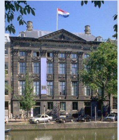
Trippenhuis National monument in Amsterdam