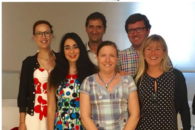
Representatives of the European patients advocacy groups (ePAGs) AMRYC, H4O and SAMS after establishing the Patient Advocacy Board of ERN GUARD-Heart at the Network Board meeting in Barcelona, Spain.